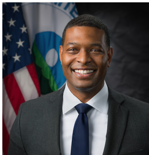
Administrator Michael S. Regan